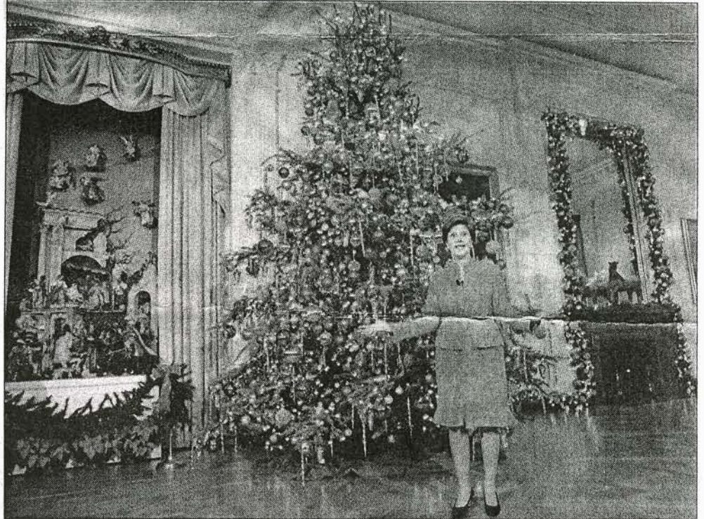
In her second Christmas at the White House, Laura Bush has transformed the mansion's holiday decor with the theme "All Creatures Great and Small."

Spotty, an English springer spaniel descended from former first dog Millie, quickly crossed under the rope to sidle up to reporters. Barney, a 2-year-old black Scottish terrier, nuzzled a red velvet tree skirt before burrowing into a garland of pine cone-studded greenery